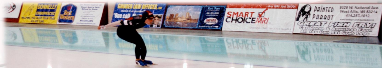
Oval Pad Signage