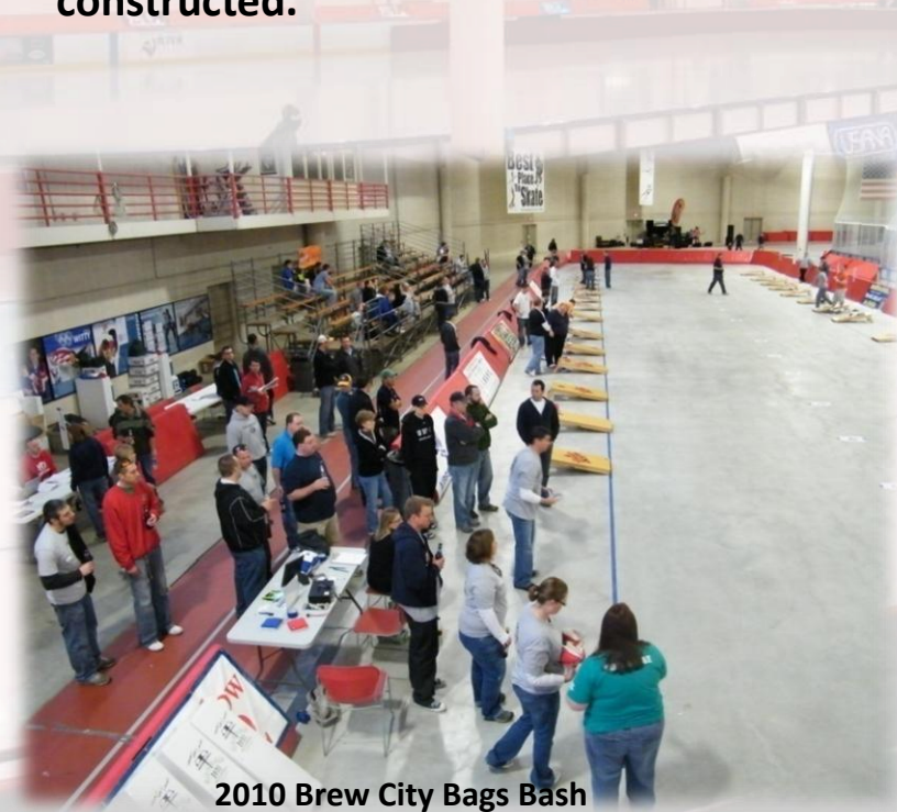
2010 Brew City Bags Bash

With 155,000 square feet under roof in a precisely controlled climate, the Pettit Center has been host to training and competitions for international skaters as well as a wide variety of special events. Two international-sized hockey rinks are surrounded by the 400 meter speed skating oval for a total of 97,000 square feet of ice surface. The Pettit Center is an impressive facility, yet it endeavors to perpetuate a standard of “Olympic Excellence, Community Well-Being” in its commitment and service to Milwaukee and nearly half-million visitors and participants annually.