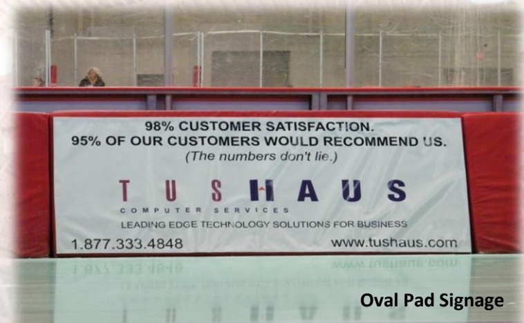
Oval Pad Signage