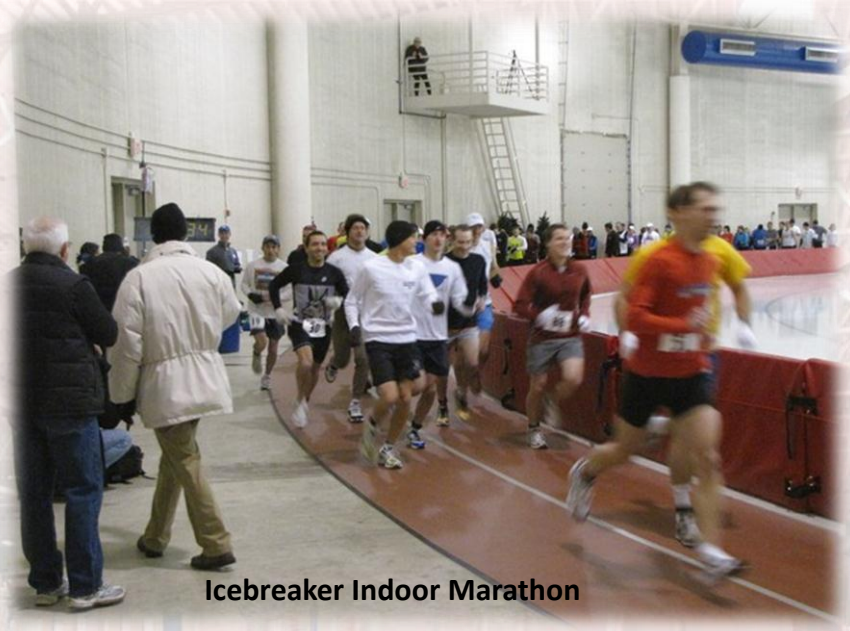
Icebreaker Indoor Marathon