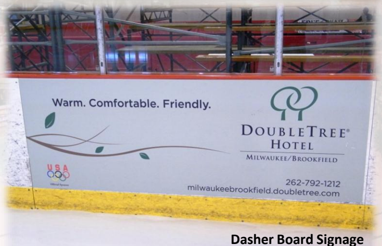
Dasher Board Signage