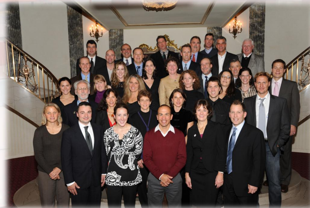
Pettit Center Olympians Dinner 2010

As an Official U.S. Olympic Training Site, the Pettit Center emphasizes high quality ice and provides training time at no charge to athletes designated with Olympic potential. The Pettit Center is proud to display the Olympic rings on the exterior of its highly visible and recognized building and is steward to its legacy and future in U.S. Olympic Speedskating.