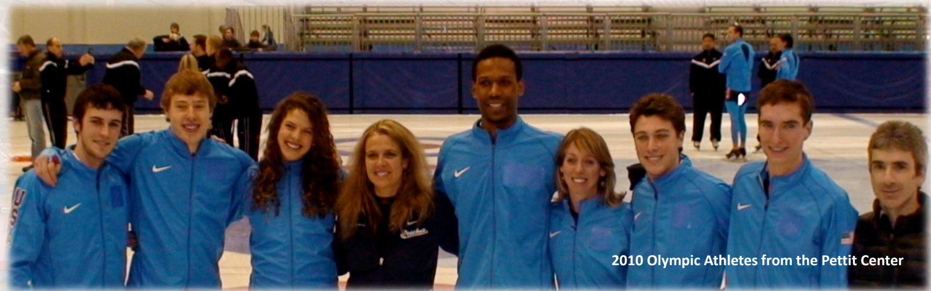
2010 Olympic Athletes from the Pettit Center