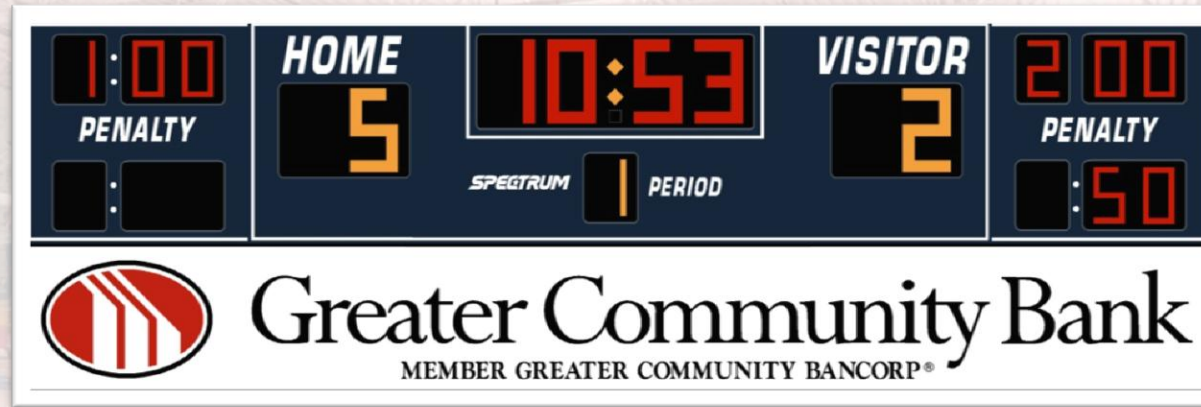
Proposed NEW Scoreboard